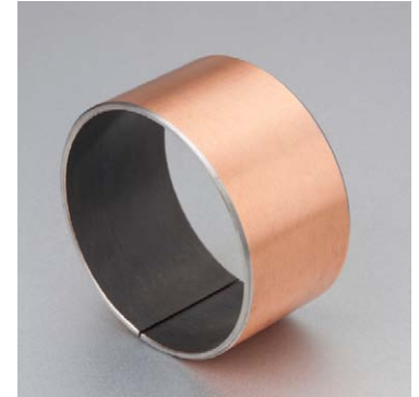
内外倒角 ID and OD chamfers